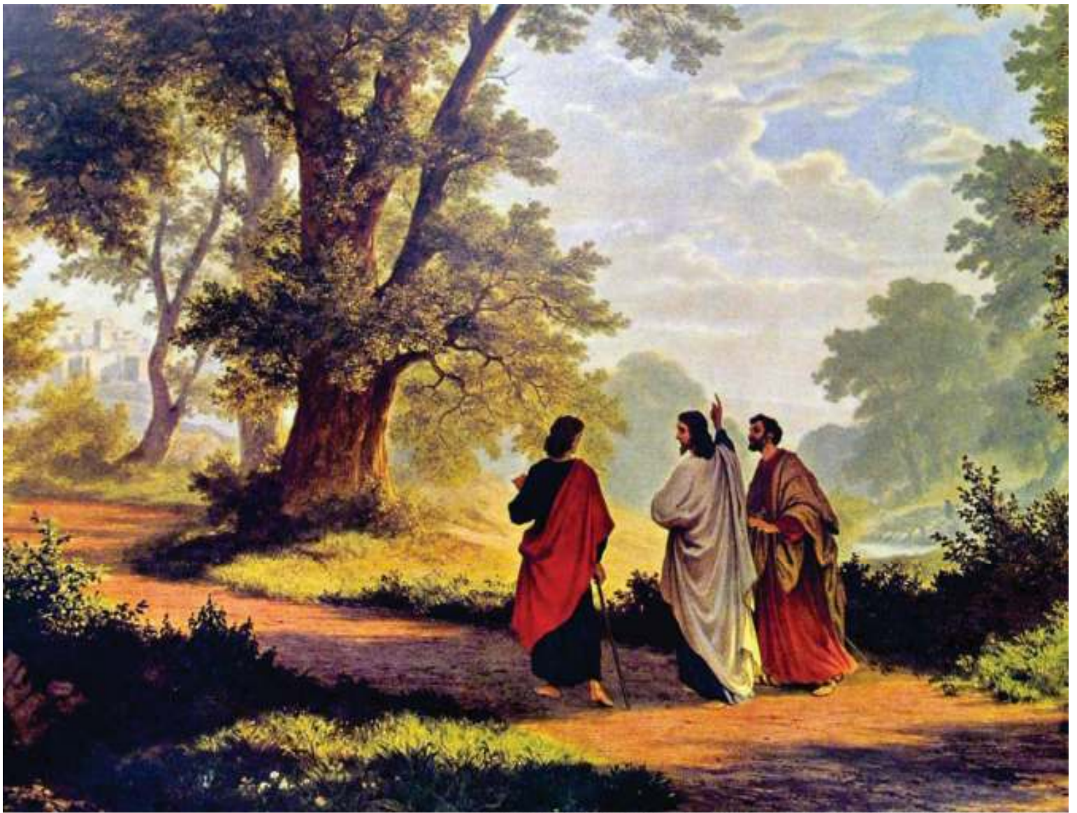
"The Road to Emmaus," an 1877 painting by Robert Zund.

And beginning with Moses and all the Prophets, he explained to them what was said in all the Scriptures concerning himself. Luke 24:27