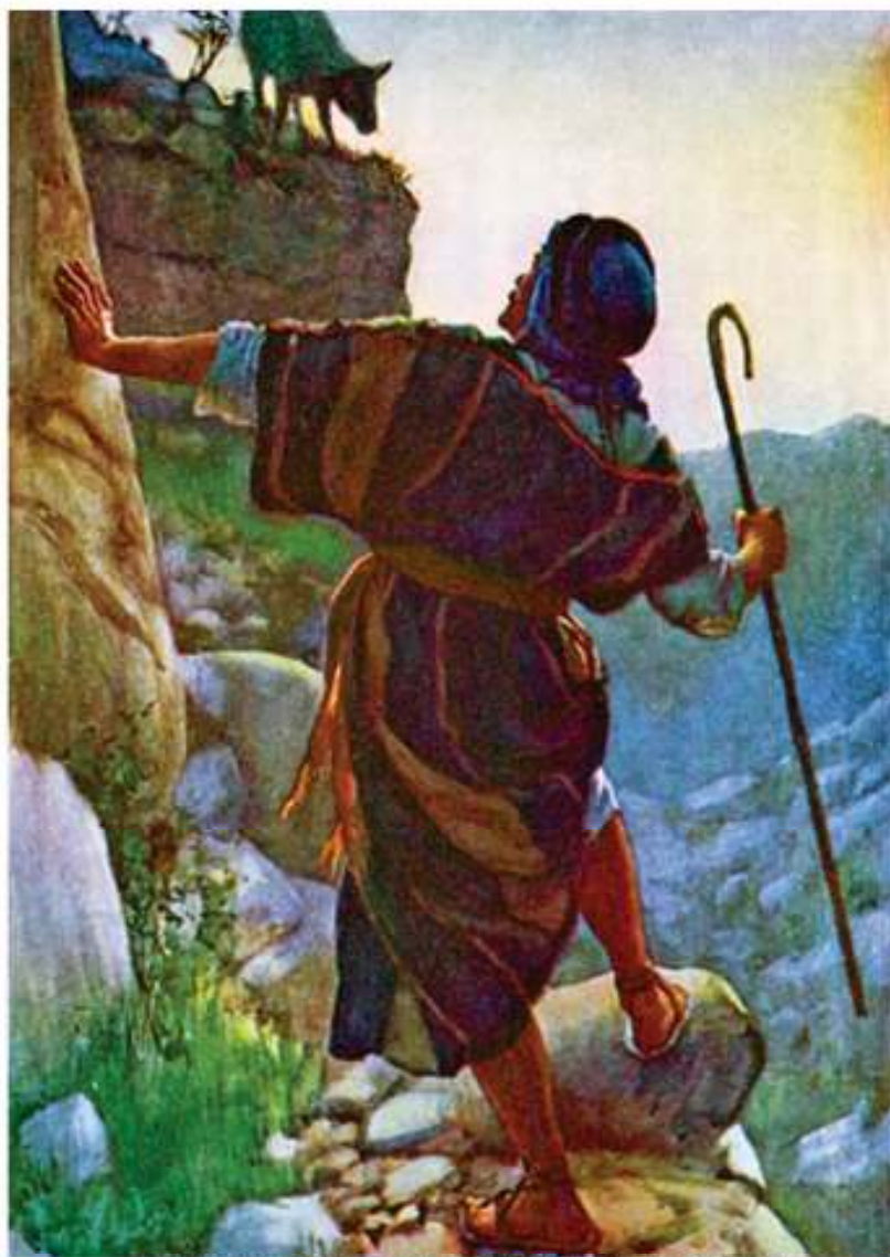
The Shepherd's Lost Sheep by Harold Copping

"Suppose one of you has a hundred sheep and loses one of them. Does he not leave the ninety-nine in the open country and go after the lost sheep until he finds it? And when he finds it, he joyfully puts it on his shoulders and goes home. Then he calls his friends and neighbors together and says, 'Rejoice with me; I have found my lost sheep.' Luke 15:4-6